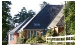
Forest Surgery Bordon