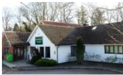
Badgerswood Surgery Headley

We are not asking a specific price but only a donation for our PPG, of a minimum of £2.